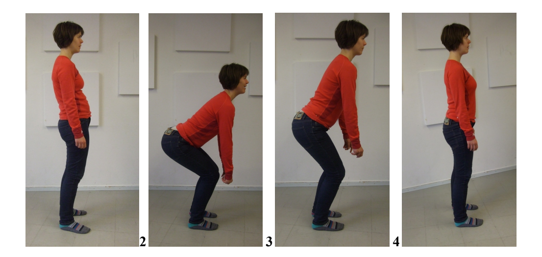
Figur 3: "The Donald Duck butt" steps 1-4, as explained in the course:

Photo 1 shows an exaggerated "bad posture" where the weight rests on the lumbar, hip and knee joints instead of being distributed on all joints and supported by the stability muscles. The hip, head and the shoulders go forward, the rib cage is collapsed. After the "Donald Duck butt" (photos 2-3) the stability muscles are in photo 4 activated through better contact with the ground and the weight is distributed and the vertical line is apparent. The abdomen is flatter because the m. transversus abdominus is active. The m. rectus abdominus is relaxed so that the rib cage can be flexible in the breathing. The head balances on the top of the spine.